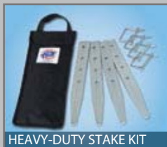
HEAVY-DUTY STAKE KIT