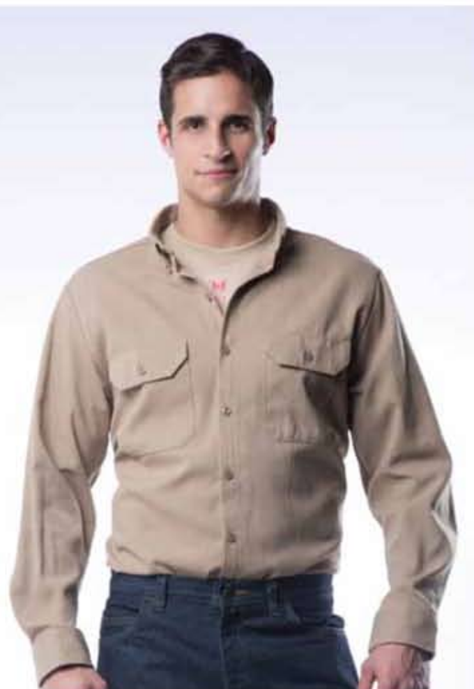
UTILITY SHIRT DF2-324LS