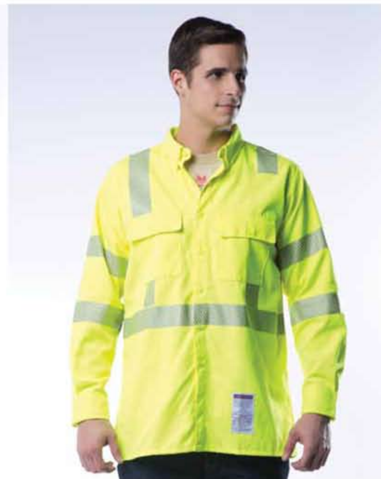
HI-VIZ UTILITY SHIRT DF2-AX3-324LS