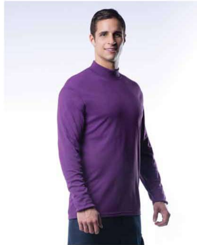
FLIGHT DECK JERSEY DF2-340FDS

By combining attention to detail with high-performing DRIFIRE fabrics, we have created an innovative solution for shipboard garments with breakthrough comfort, performance and protection.