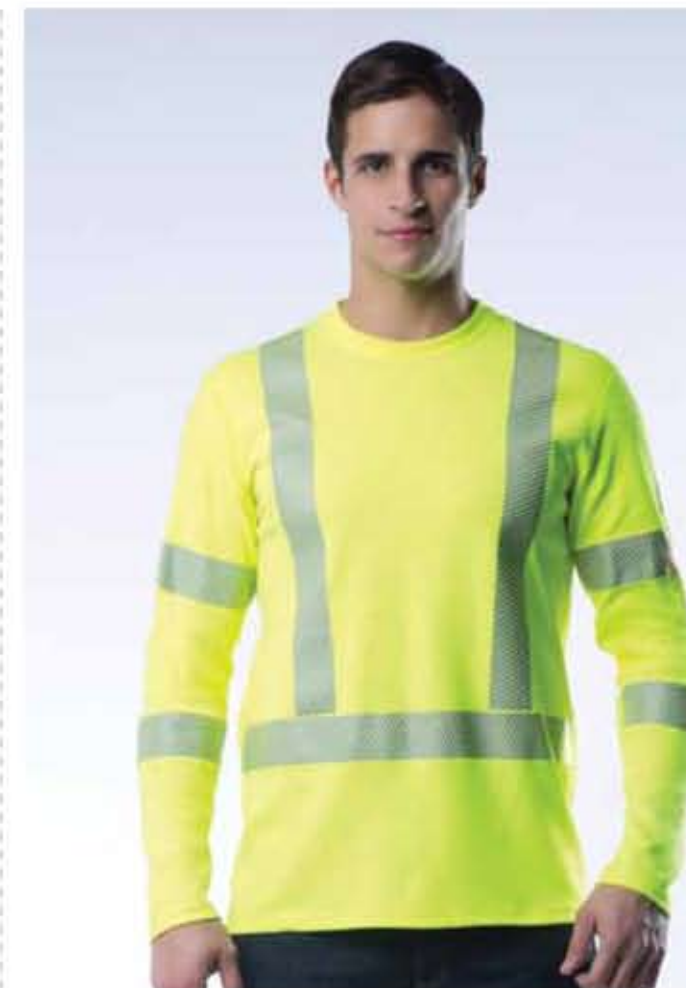
HI-VIZ KNIT DF2-AX3-265ALS