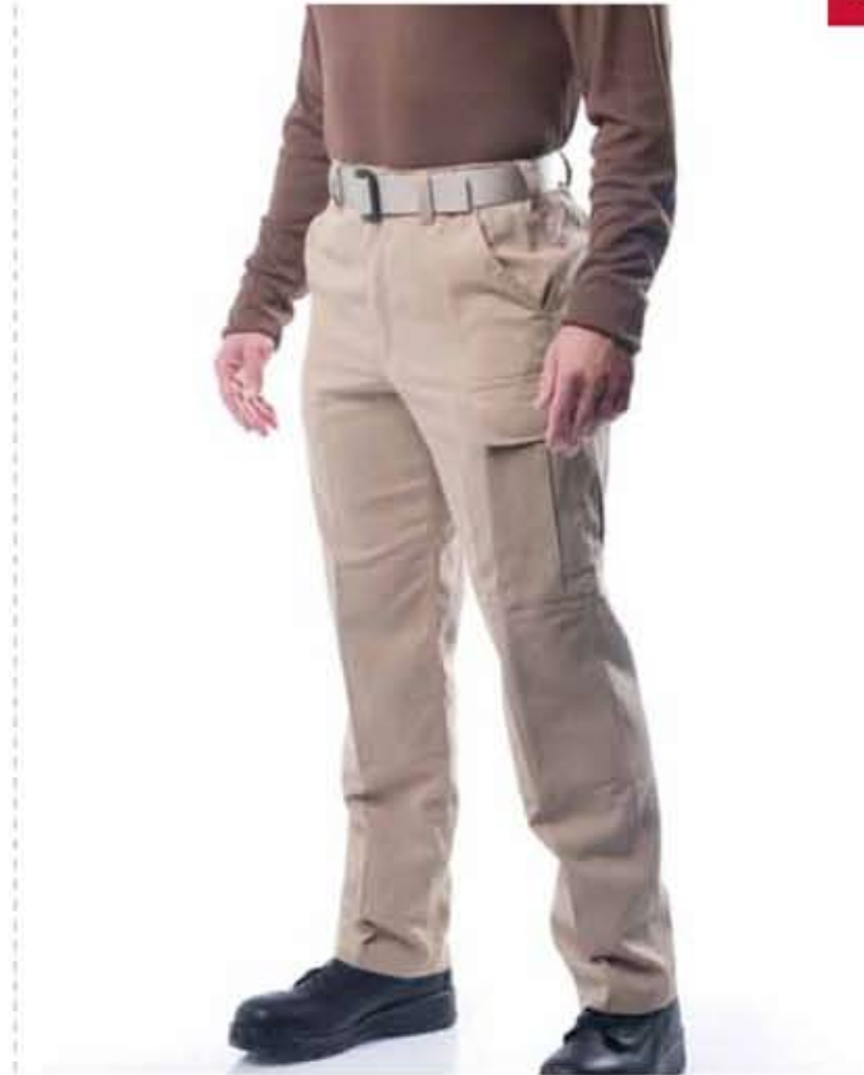
FLIGHT DECK PANT Officer: DF2-850FDPO Enlisted: DF2-850FDPE