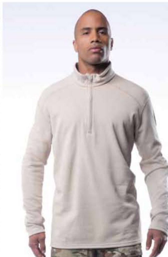
MOCK-ZIP FLEECE DF2-277MZ